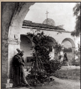
A portrayal of early life in San Juan Capistrano and the Mission. Many Juanenos married into the early Spanish families from this area.

As a pre-Mission descendant of the Juaneno Band of Mission Indians and two early Californio Rancho families, I have been invited to share the accurate, factual story of our historical connection to this land and Mission called San Juan Capistrano.