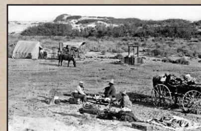
Juaneno and Early Californio Rancho Vaquero descendants take rare time to relax, share stories and a meal.