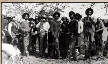
Juaneno and Early Californio Rancho Vaqueros gather at a local rancho.