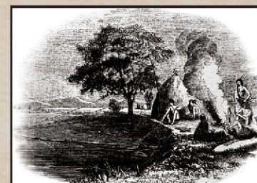
Ajachemen/Juaneno hunters and gatherers netting fish, one of their many food sources.